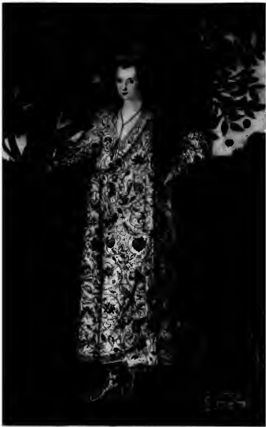
Queen Elizabeth in fancy dress from the picture at Hampton Court attributed to Zucchero